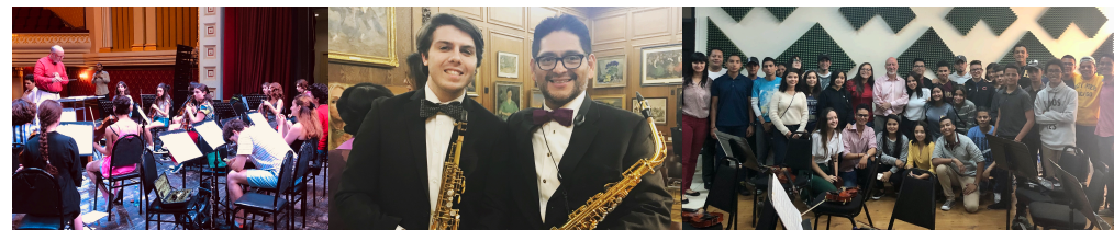
MISA festival orchestra Tbilisi, Georgia