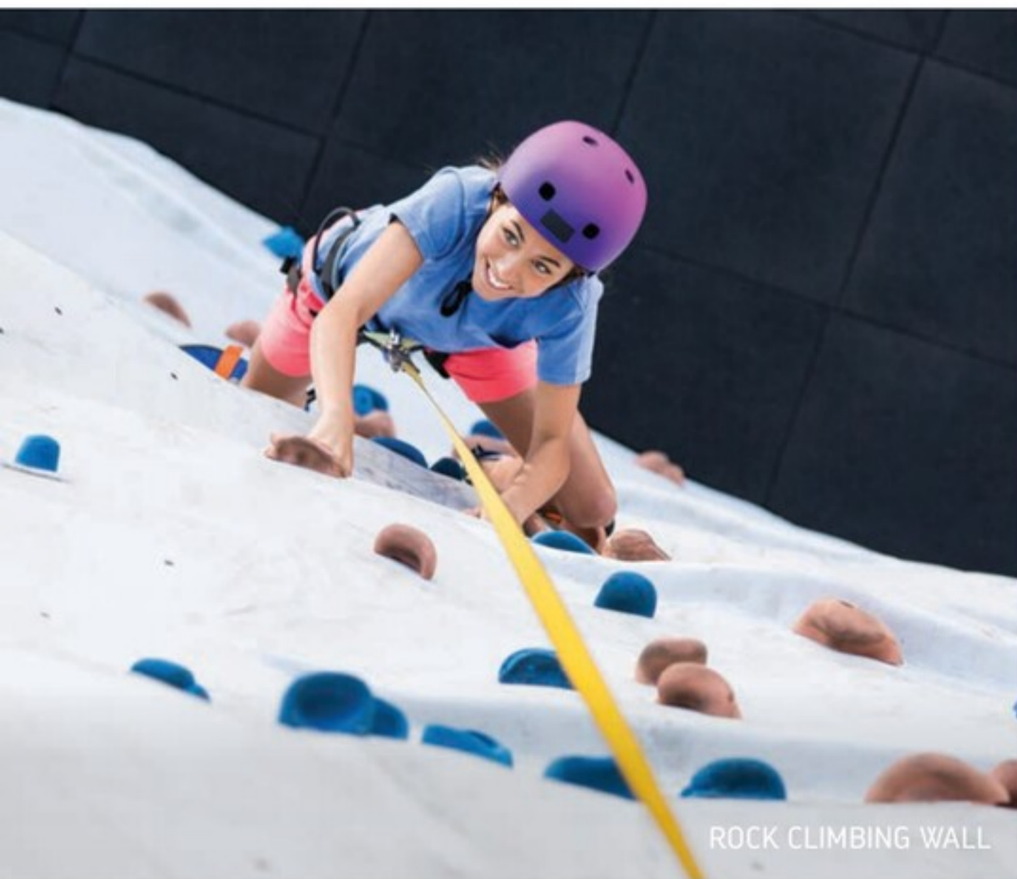
ROCK CLIMBING WALL