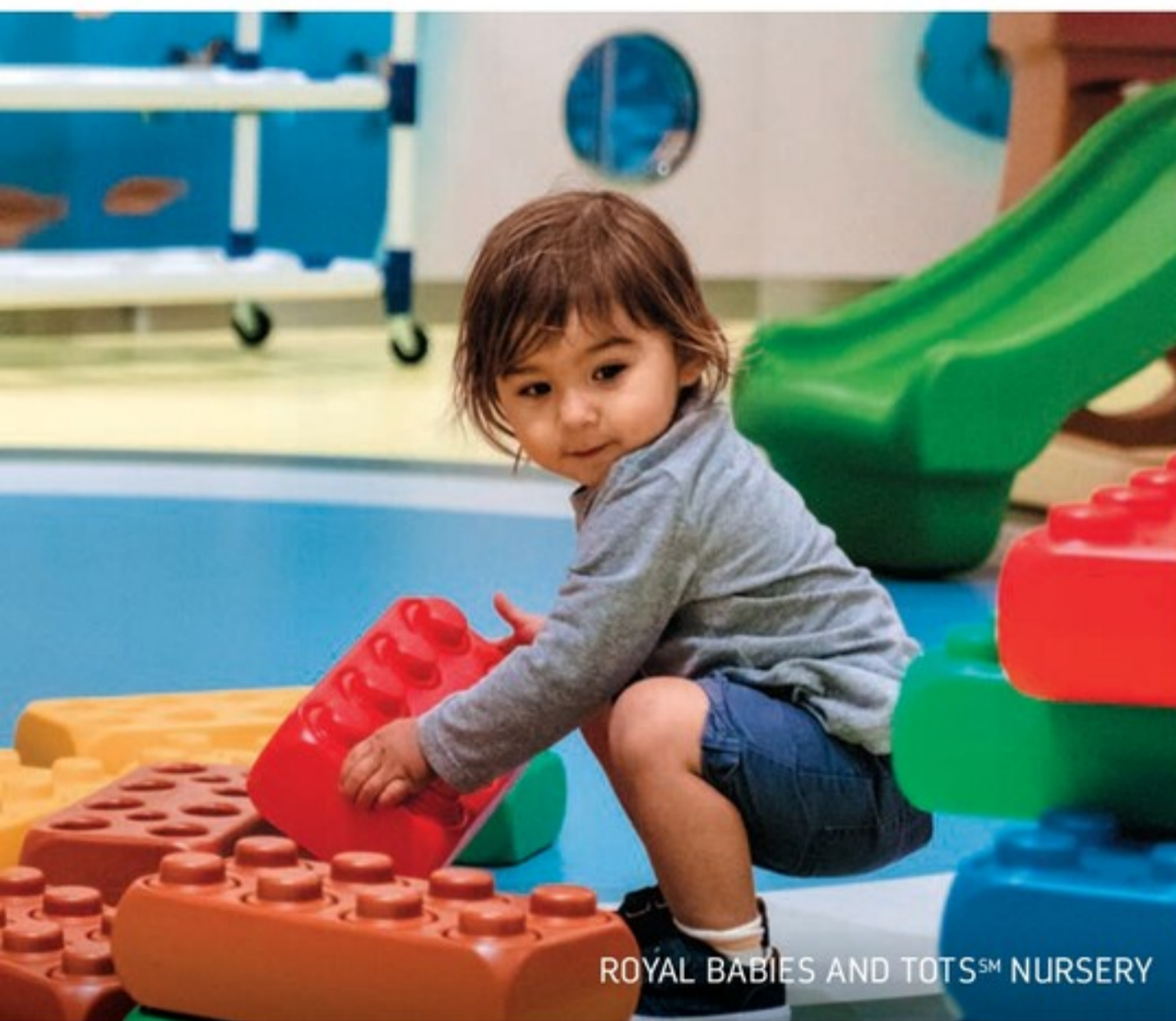
ROYAL BABIES AND TOTS SM NURSERY