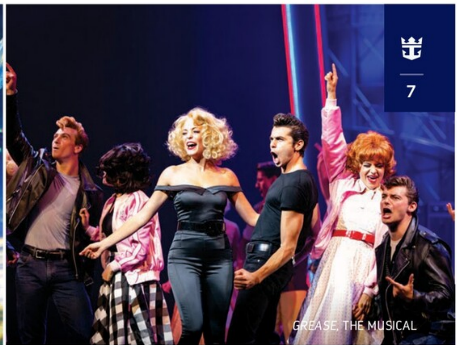
GREASE, THE MUSICAL