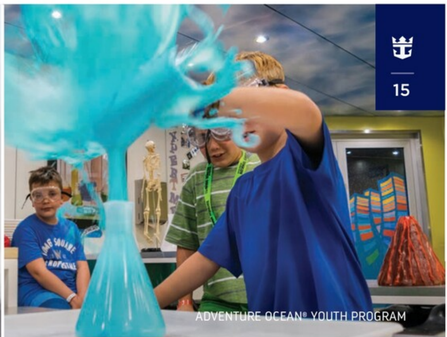
ADVENTURE OCEAN® YOUTH PROGRAM