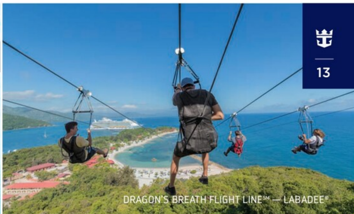
DRAGON'S BREATH FLIGHT LINE SM — LABADEE ®