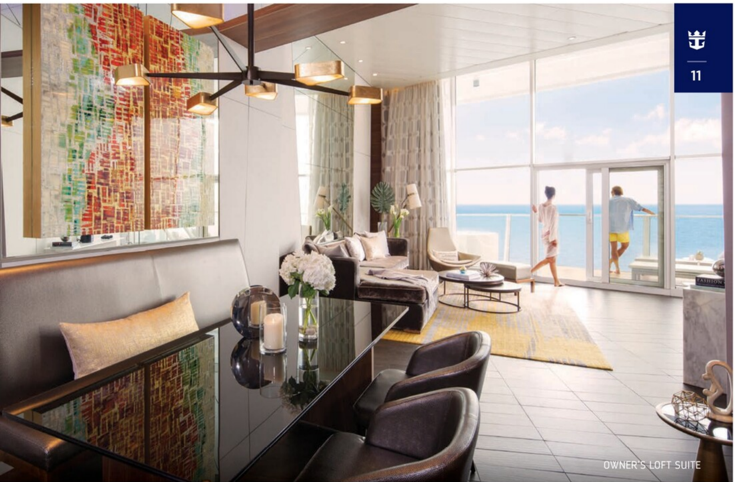
OWNER'S LOFT SUITE