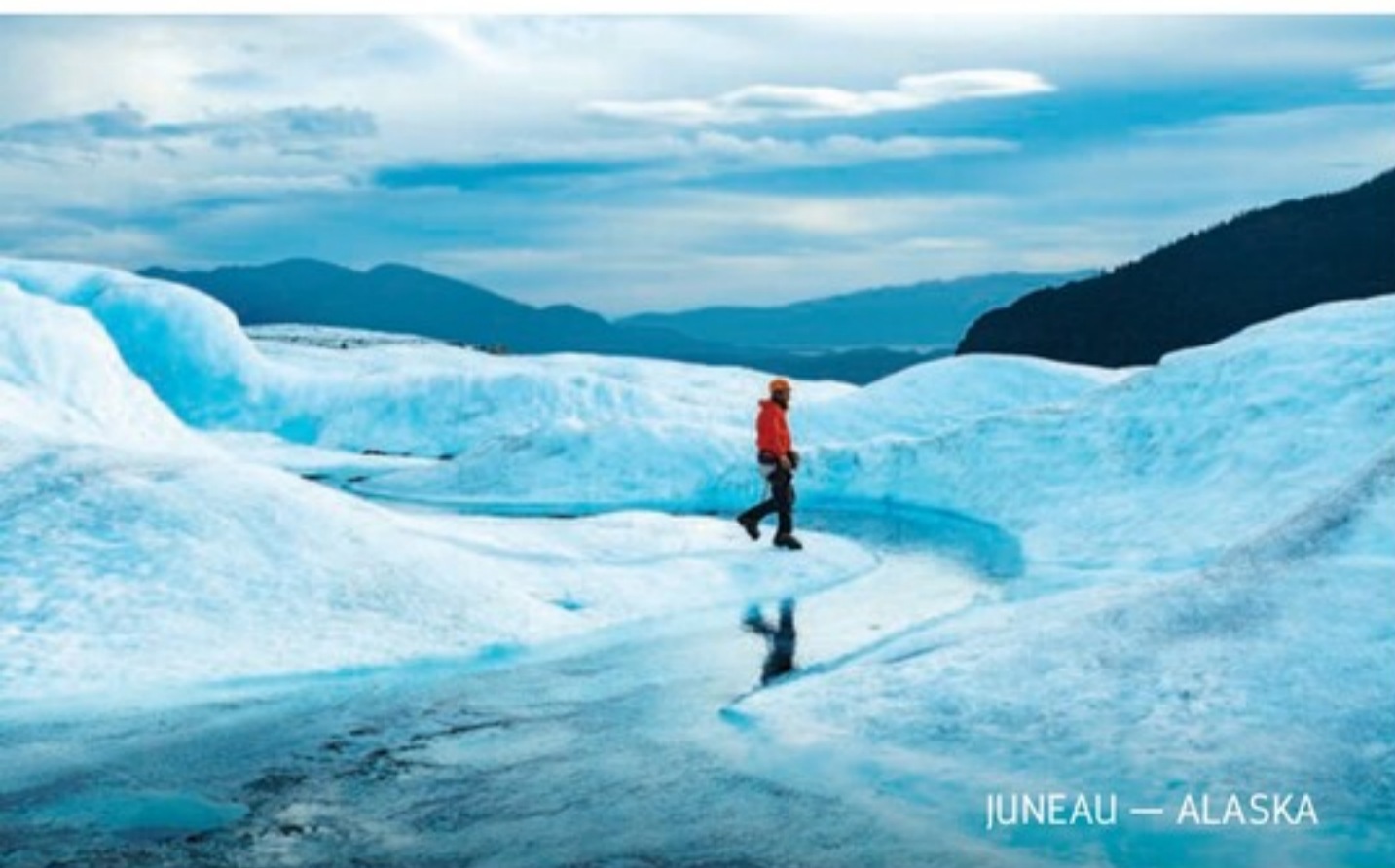
JUNEAU — ALASKA