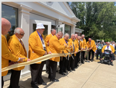
Left: Pilgrimage ribbon cutting ceremony for updated Moose museum.