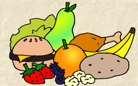
you can eat