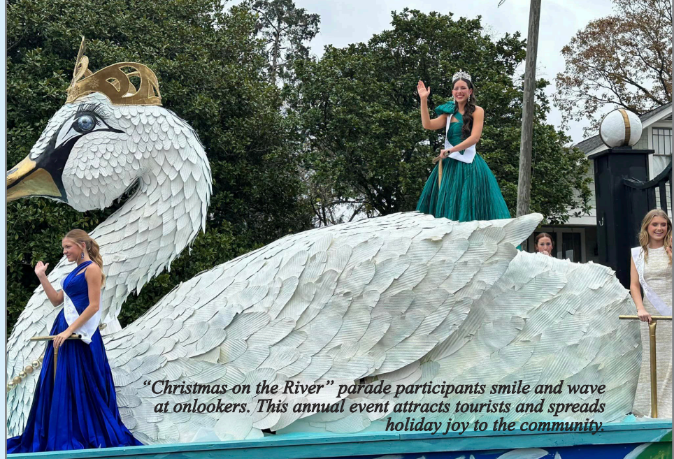
“Christmas on the River” parade participants smile and wave at onlookers. This annual event attracts tourists and spreads holiday joy to the community.