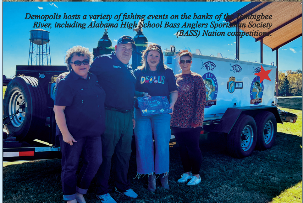
Demopolis hosts a variety of fishing events on the banks of the Tombigbee River, including Alabama High School Bass Anglers Sportsman Society (BASS) Nation competitions.