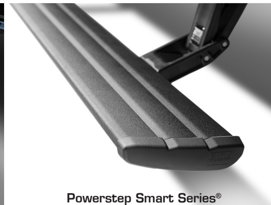
Powerstep Smart Series®