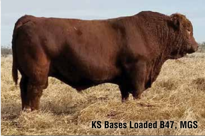
KS Bases Loaded B47, MGS