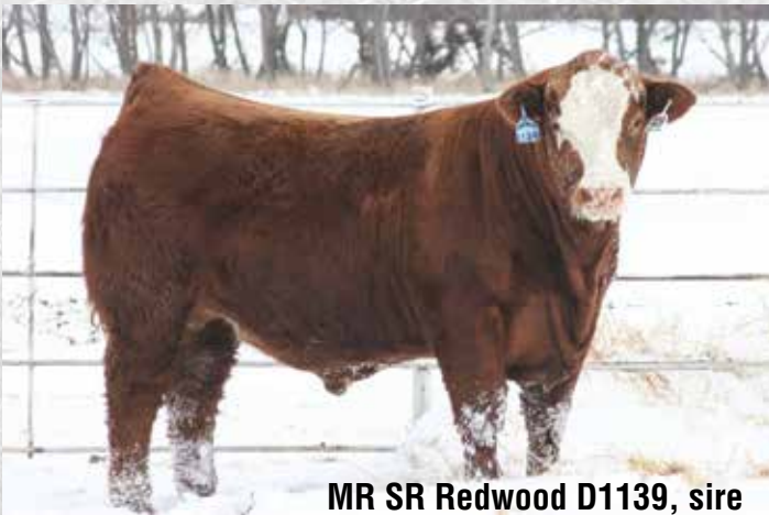
MR SR Redwood D1139, sire

TOTAL OUTCROSS!!! I have been pretty excited about the potential and possibilities of this calf since day one. Sired by MR SR Gunslinger and out of the dam of MR SR RED OCTOBER who is currently the #1 API and #19 TI sire in the entire ASA database. The mating possibilities of this purebred calf are virtually endless. He is every bit as good as his brother was with top 3% API and 15% TI.