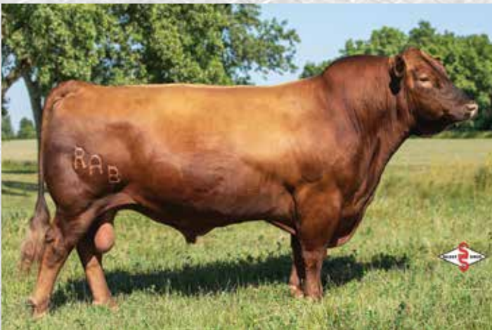
Bieber CL Stockmarket E119, sire to Lot 305

A larger framed bull with excellent carcass data that all the feeders are asking for. He walks on a big foot, has a square hip and large testicles. His daughter's should make excellent cows.