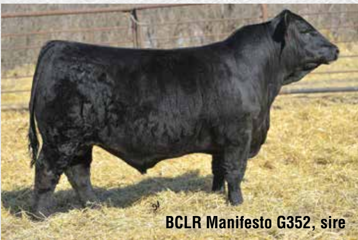
BCLR Manifesto G352, sire

POWER and POUNDS are the best way to describe this purebred baldy. Top 2% for WW and 4% for YW. He has a 111 WW ratio and 10 EPDs in top 35%.