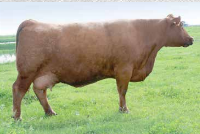
NER Copper Queen 2657, PGD to Lot 313

Larger framed young bull with lots of potential. Very balanced overall going back to a good ol' Harley Moser dam, Bonnebell.