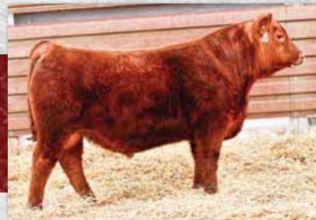
Lot 301 - LAZYJ STOCKMARKET 211-998