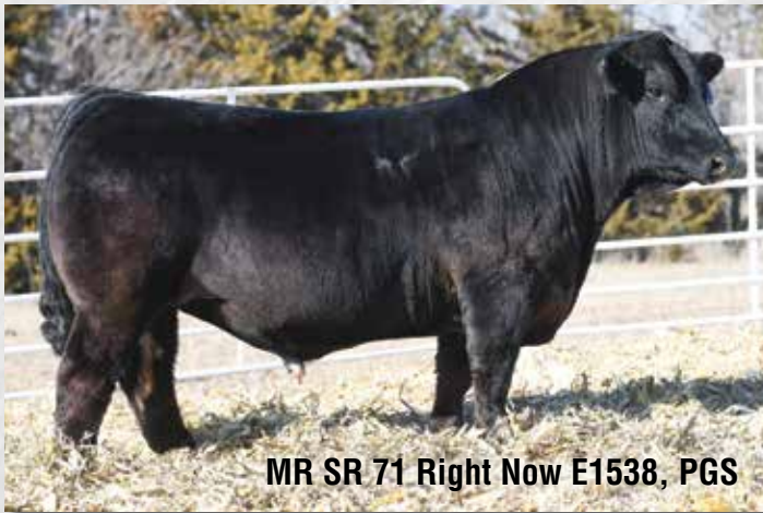
MR SR 71 Right Now E1538, PGS

Homo-black and homo-polled. You will drive a long ways to find a better Mic Drop calf. BW ratio of 88, WW ratio of 105 and 12 EPDs in the top 25%.