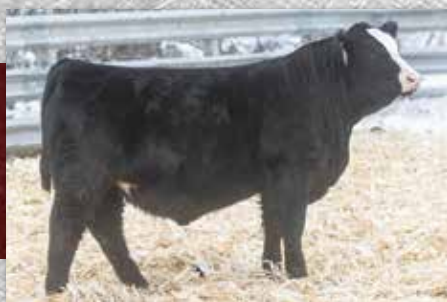
Lot 4 - MR FR K4