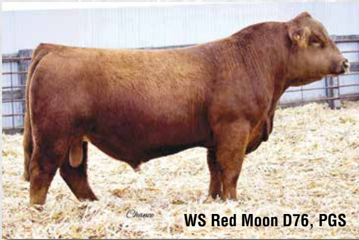
WS Red Moon D76, PGS