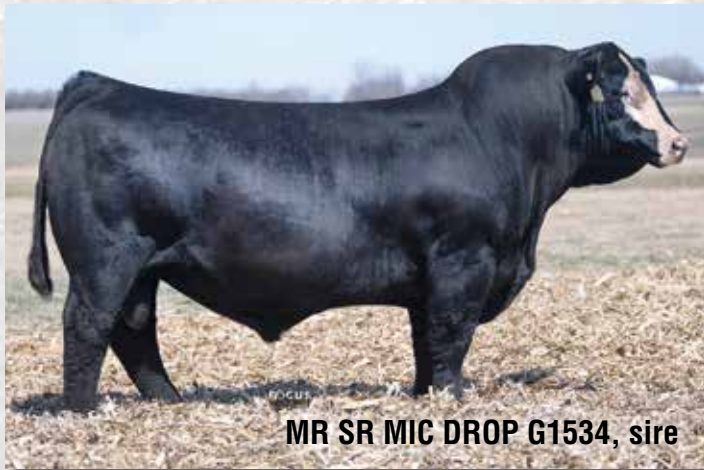
MR SR MIC DROP G1534, sire

Hetero-black and homo-polled. Solid black bull from a good, young cow.