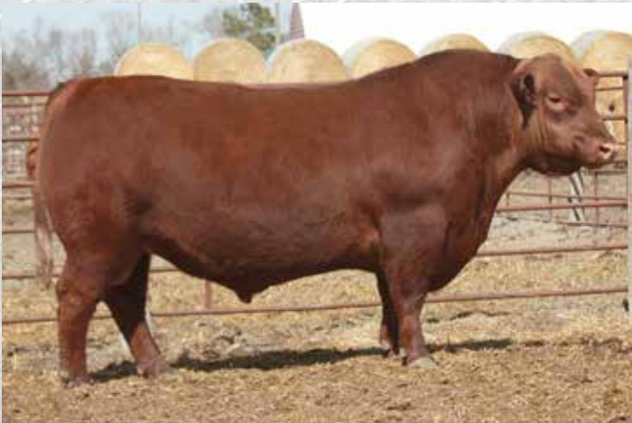
LSF RAB Performance 2772Z, MGS to Lot 340

Young bull sired by the High Capacity out of a Hard Drive female. Watching this calf mature will be fun, he has the growth and carcass numbers to boot.