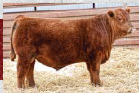
Lot 312 - LAZYJ STOCKMARKET 226-5220

DVAuction Catalog and videos will be available online at www.dvauction.com .