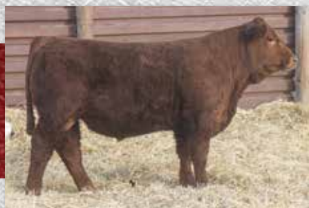
Lot 81 - MR SR K2051