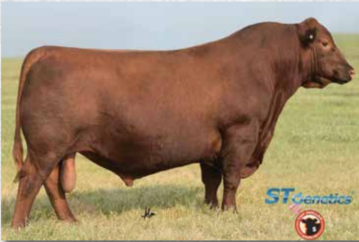
Over Draft Pick 413D, sire to Lot 308

Another Ringside son that will put frame and growth in his offspring. This calf goes back to the good Z09 cow that was known for performance in our herd.