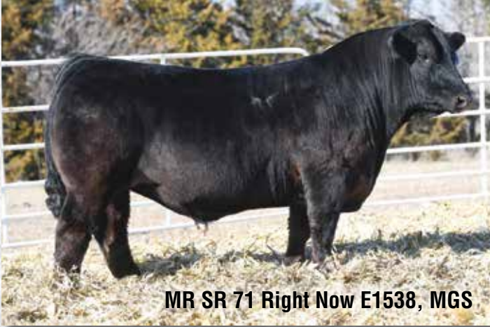
MR SR 71 Right Now E1538, MGS