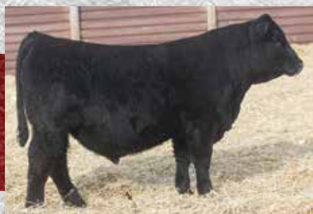
Lot 50 - MR SR K1629