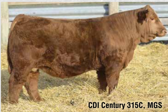
CDI Century 315C, MGS

DNA tested homo-black and homo-polled. He is solid black and was the #1 calf at weaning with 10 EPDs in the top 25%. You need to see this deep-bodied bull in person to appreciate him.