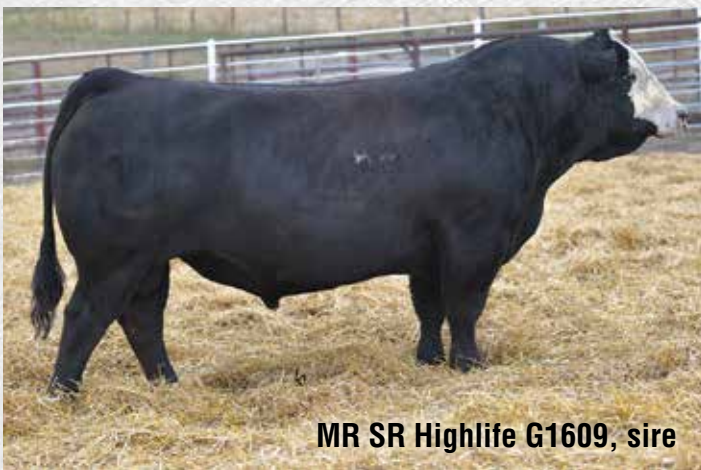
MR SR Highlife G1609, sire