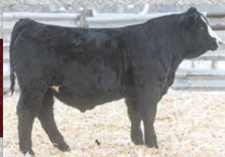
Lot 1 - MR FR K1