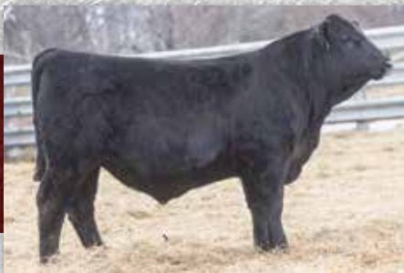
Lot 22 - MR FR M22