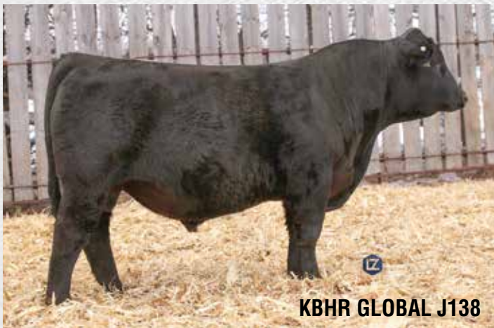
KBHR GLOBAL J138

These Global calves have been really impressive as they are all out of heifers. Good solid black son of Global with 103 WW ratio.