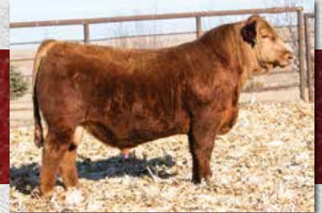
Lot 301 - LAZYJ SPARK-TACULAR 414-8136