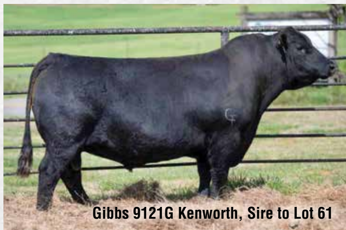
Gibbs 9121G Kenworth, Sire to Lot 61