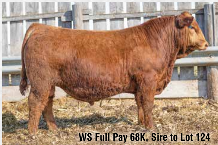
WS Full Pay 68K, Sire to Lot 124