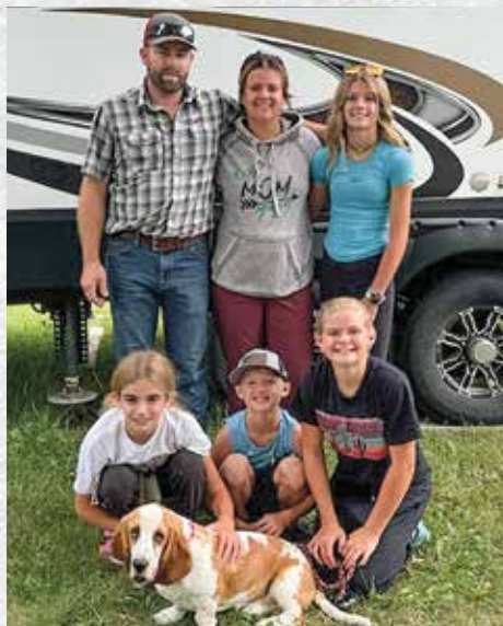
State Fair and Summer Spotlight fun!