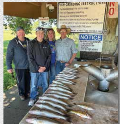
A little July 4th fun!