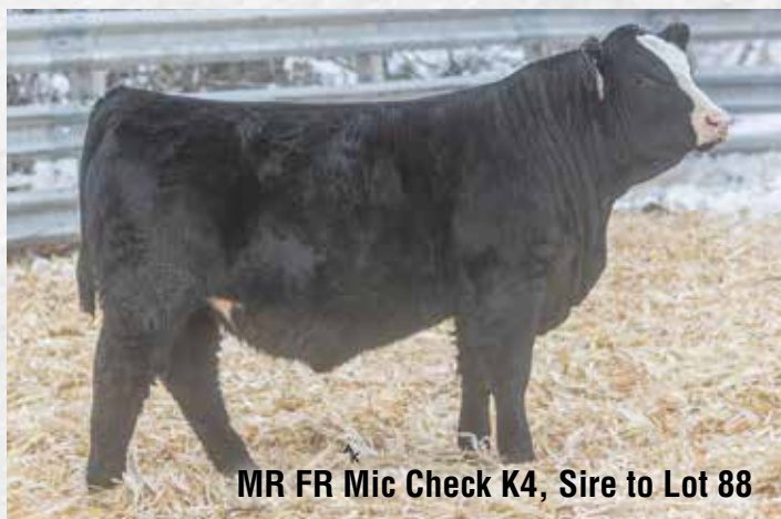
MR FR Mic Check K4, Sire to Lot 88