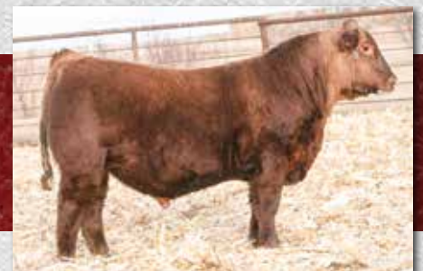
Lot 303 - LAZYJ GRINDSTONE 410-8173

Catalog and videos will be available online at