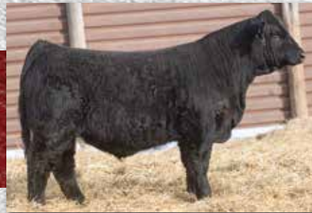
Lot 54 - M2052