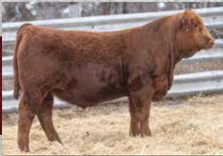
Lot 20 - MR FR M20