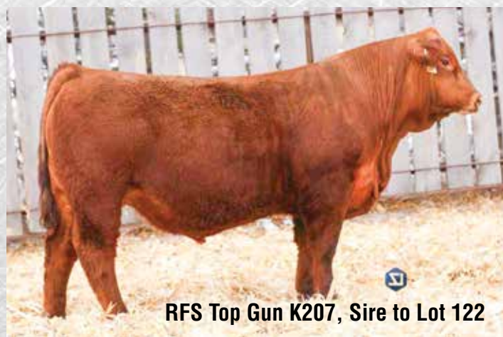
RFS Top Gun K207, Sire to Lot 122

Another good calving ease prospect with excellent growth. He started at 73# and adjusted to 720# out of a first-calf heifer. 13 EPDs in the top 25% and 107 WW ratio.