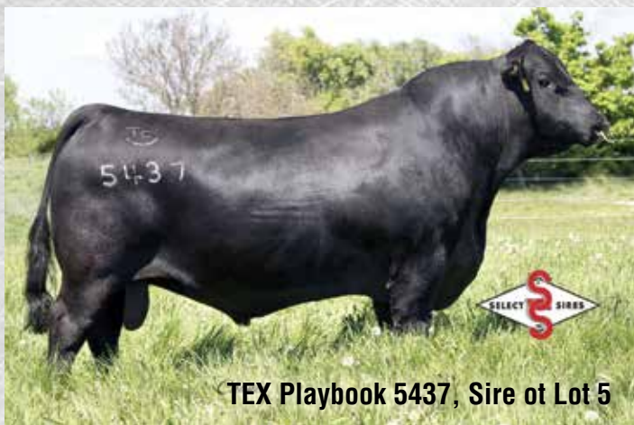
TEX Playbook 5437, Sire of Lot 5

Tex Playbook sired calf. He is 1/4 SM 3/4 Angus. The Playbook calves have always been good for us.