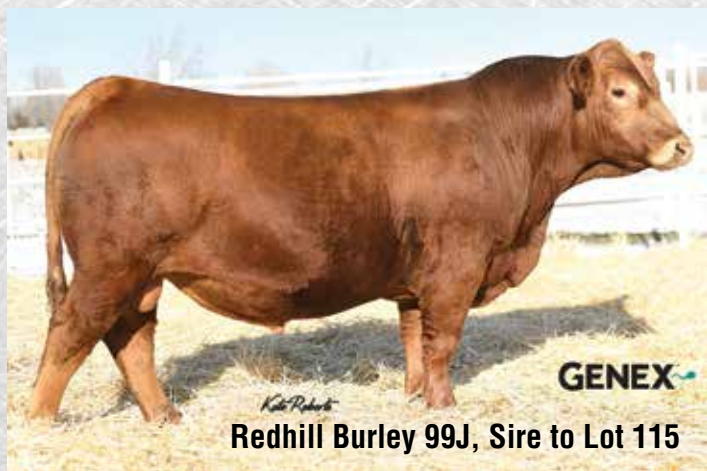
Redhill Burley 99J, Sire to Lot 115

Redhill Burley is a new sire group for our red customers and they are AWESOME. This is one of the thickest, structurally correct red calves we have raised. Actual WW of 748# and he hasn't let off the gas since weaning. 108 WW ratio.