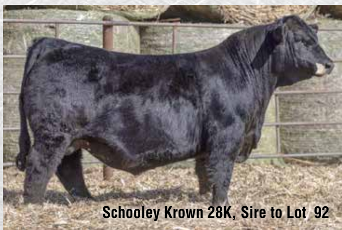
Schooley Krown 28K, Sire to Lot 92

Super stylish Krown calf with 12 EPDs in top 35%.