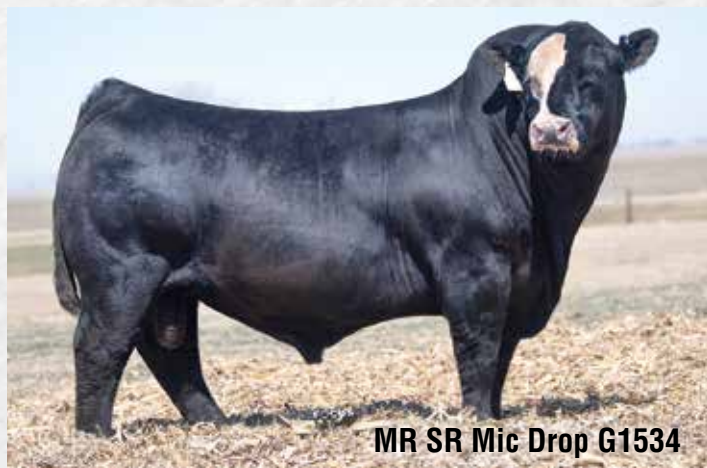
MR SR Mic Drop G1534