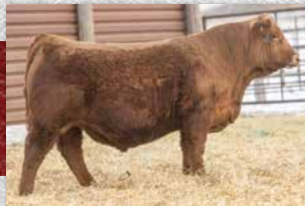
Lot 114 - M1805