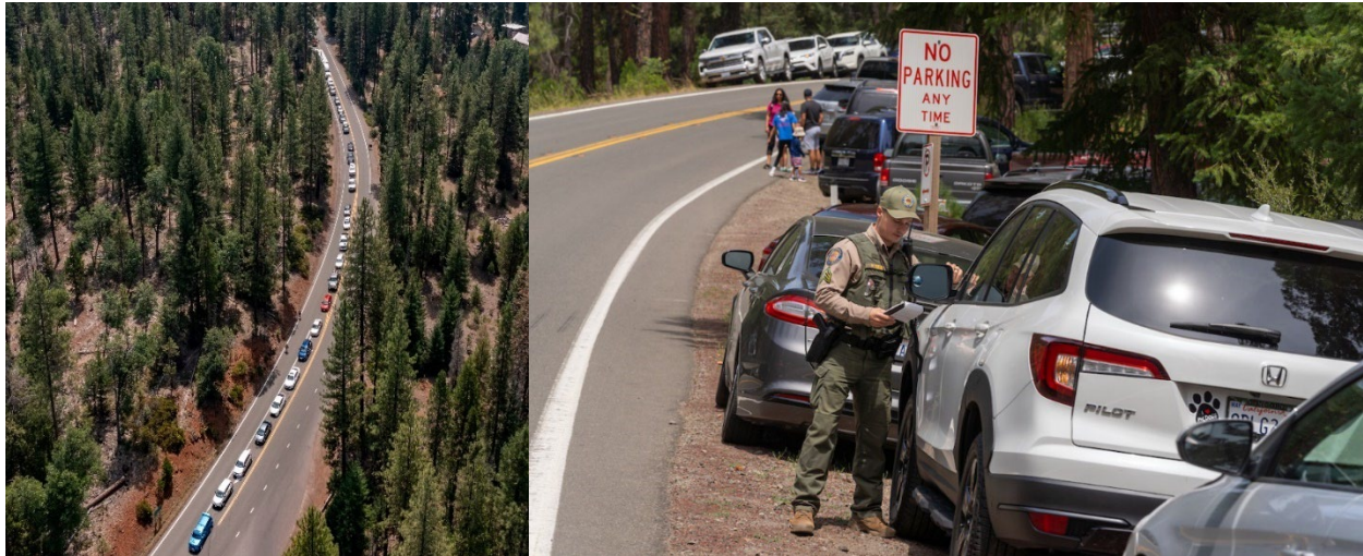
Traffic along SR-89 and cars being ticketed for illegally parking along the highway. Photos from California State Parks.

damage to sensitive vegetation and sacred tribal land, traffic backups, illegal parking, public safety concerns and sanitation issues. Park facilities built in the 1960s were not designed to handle current visitation levels. The annual surge in visitation has resulted in long lines to enter the park and frequently creates unsafe traffic conditions on State Route (SR) 89, which threatens public safety and the park's resources. Campers with reservations are hesitant to leave the park, knowing that it may take up to two hours to re-enter on busy days. Due to limited parking, Burney Falls will typically reach its capacity on weekends, forcing the park to close for several hours each day. Visitors who have driven multiple hours to reach the picturesque park are met with the unfortunate news that they can't enter and will need to try again later.