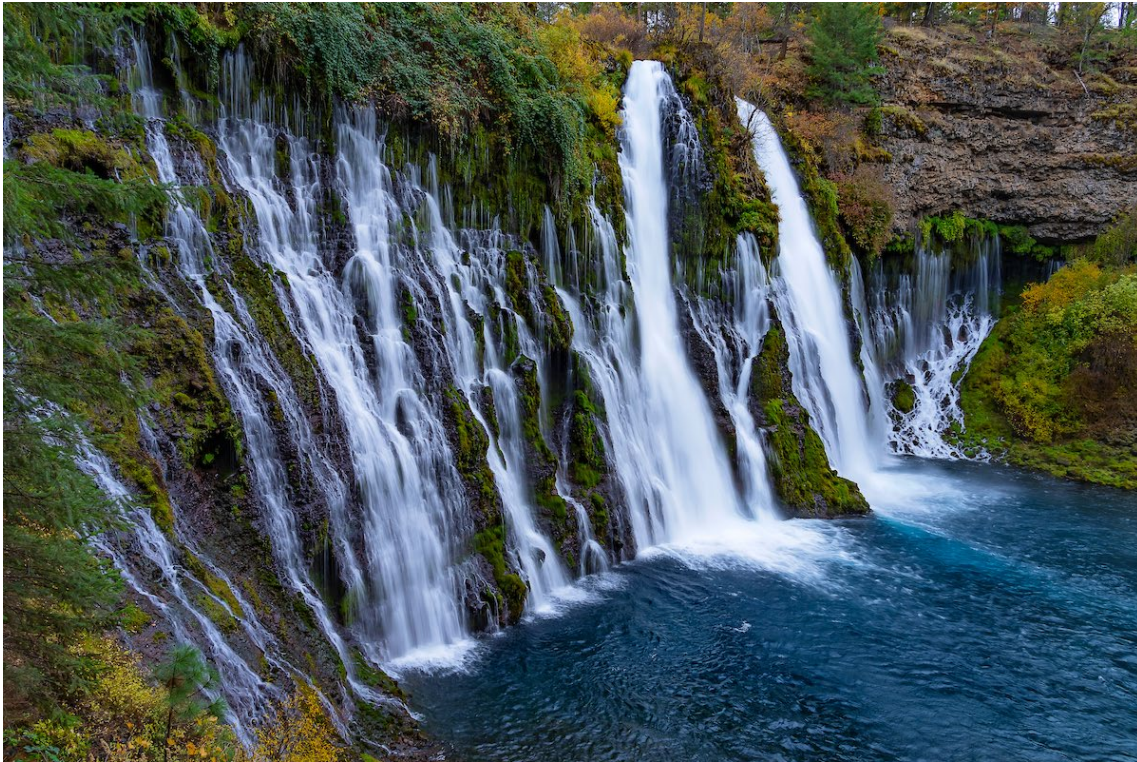
View of the iconic falls at McArthur-Burney Falls Memorial State Park.

BURNEY – To reduce the impacts of overcrowding and to create a significantly improved visitor experience, California State Parks will begin a pilot program requiring reservations to visit McArthur-Burney Falls Memorial State Park (Burney Falls) on Friday-Sunday and holidays during peak visitation season, starting Friday, May 15, through Sunday, Sept. 27. The goals of this new day-use reservation system, which will not be required Monday-Thursday, are to