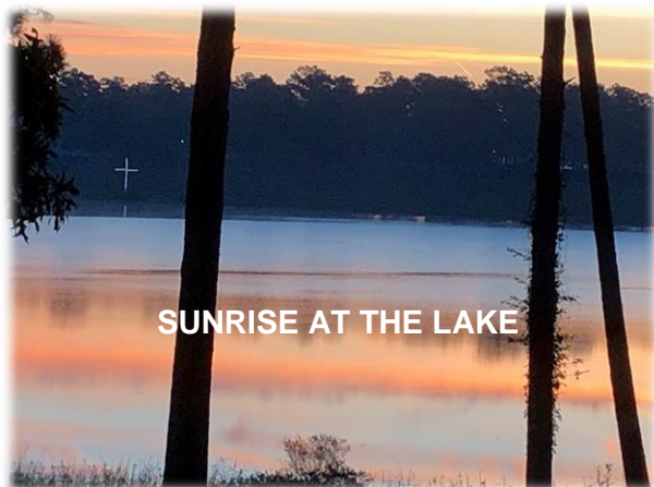
SUNRISE AT THE LAKE

A business meeting that will include election of officers is on the agenda, so plan to attend if you possibly can.