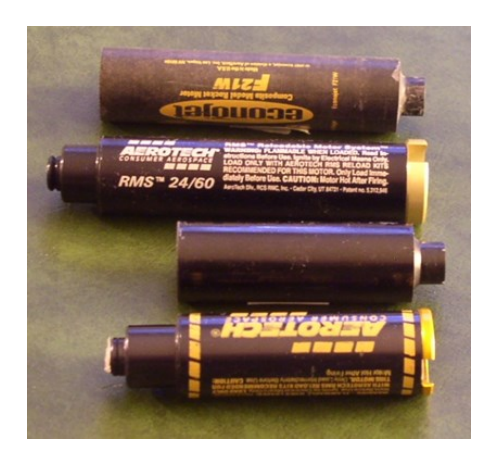
24/40 & 24/60 hardware, 24/70 & 24/95mm Single Use

Reference: www.valuerockets.com & www.hobbylinc.com