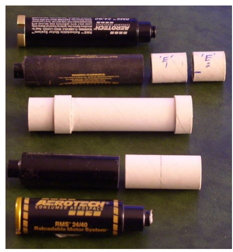
24mm adaptor, 'E' space, cut 'F' spacer, 24/40 and 24/60 hardware

The F32T's and F35W's are niche motors. I have not seen much written about them, so I had to go through this research and article.