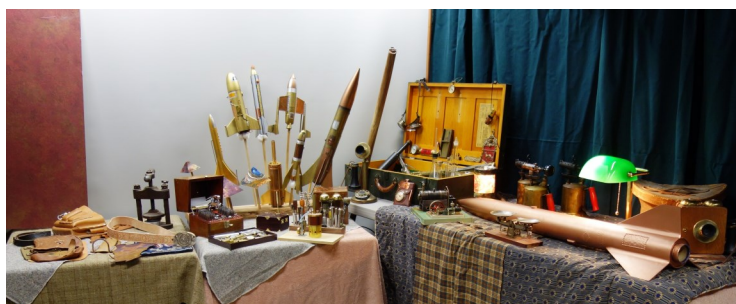
Preliminary steampunk rocket display mockup for 13 Gears