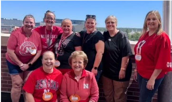
Charcuterie board workshop with Grazing Gouda Oct. 4th.