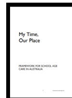
My Time, Our Place; Framework for School Age Care in Australia

Critical reflection: Reflective practices that focus on implications for equity and social justice ( Early Years Learning Framework – refer to Sources ).