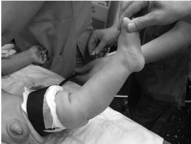
Figure 1. Femur's length is so small that makes the use of pneumatic tourniquet, for plastic restoration of quadriceps in a child with arthrogryposis and genu recurvatum, problematic.

in operations of upper and lower limbs in infants and children that were hospitalized in our Department from October 2007 to April 2008. Forty children (23 boys and 17 girls) suffering from congenital deformities, benign tumors or fractures in limbs were submitted into operation. Mean age of the patients was 5.6 years old (range from 6 months to 14 years). Twenty three operations in upper and 23 in lower limbs were conducted as we can see in Table 1. Exclusion criteria were unstable or particularly displaced fractures, dislocations, severe skin disorders and procedures with estimated surgical time more than 2 hours. Limb dimensions smaller than 24 centimeters in the site where the tourniquet was to be placed, did not discourage us despite the relevant references 1 .