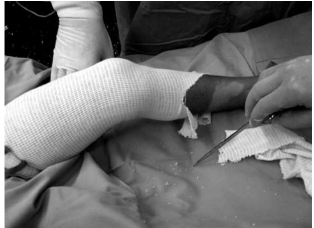
Figure 4. Scrub nurse was concerned about the presence of free particles of cut stockinet near the surgical field which were difficult removed.