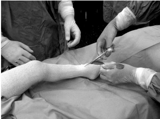
Figure 3. Scrub nurse was complaining about the use of the sterilized scissors to open the applied stockinet in the beginning of the operation.