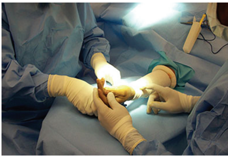
FIGURE 2: S-MART after application.

in Table 1 along with the average tourniquet time for the procedure and any complications. A total of 3 postoperative complications were identified, only 1 of which was directly related to the tourniquet's use (1 neuropraxia which resolved by 6 months, 2 superficial wound infections), and the use of the tourniquet was discontinued intra-operatively in 1 case as a result of a venous tourniquet effect and inadequate bloodless field.