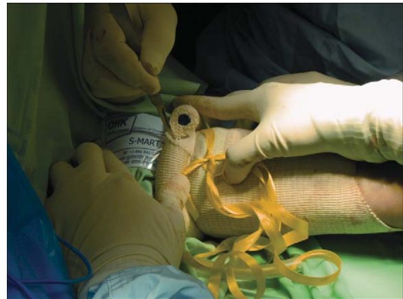
FIGURE 4. Protective card inserted beneath the ring and the HemaClear is cut using a scalpel.

HemaClear may be used on the upper or lower extremities and is available in 4 circumference ranges: 14 to 28 cm, 24 to 40 cm, 30 to 60 cm, and 50 to 90 cm. In this study, we used the HemaClear/40 (24 to 40 cm) only.