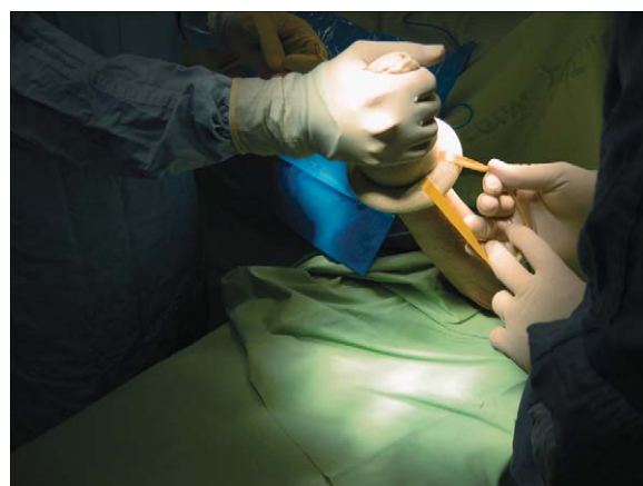
FIGURE 2. Fingers are held together and the straps are pulled proximally.