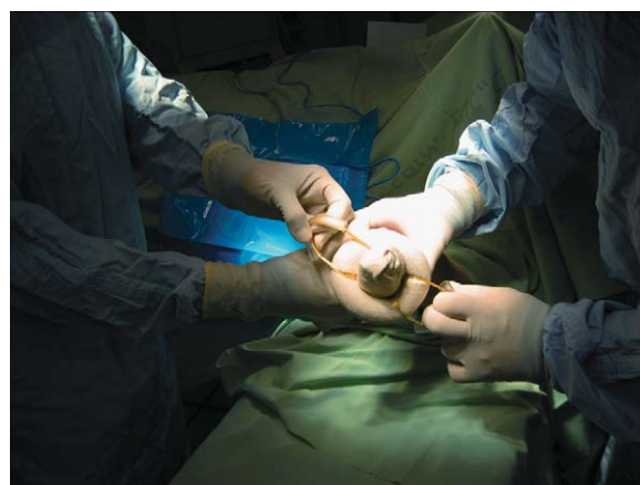
FIGURE 1. HemaClear is placed on the fingers.

Copyright © 2009 by Lippincott Williams & Wilkins