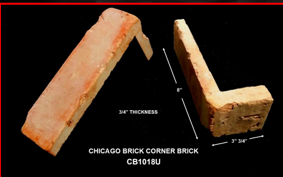
3/4" THICKNESS CHICAGO BRICK CORNER BRICK CB1018U

Item # VC1016U - Brickera V-Cut Brick. Chicago Brick Veneer. The brick is used for Wall Veneer Applications, Kitchen Back Splash, Fire Places, Chimneys, BBQ's, Columns and many other applications. You will require 7 bricks per sq/ft.