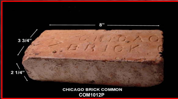
CHICAGO BRICK COMMON COM1012P

Item # COM1012P - Brickera Full Size Brick. Chicago Brick Common Full Size. The brick is used for Driveways, Pool Decks, Walkways, Fire Places, Chimneys, BBQ's and many other applications. You will require 4.5 bricks per sq/ft. The Pallet carries 495 -510 bricks, it covers between 110-115 sq/ft. and the Pallet weighs 2,200 lbs.