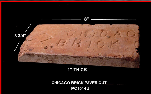
1" THICK CHICAGO BRICK PAVER CUT PC1014U

Item # COM1012P - Brickera Full Size Brick. Chicago Brick Common Full Size. The brick is used for Driveways, Pool Decks, Walkways, Fire Places, Chimneys, BBQ's and many other applications. You will require 4.5 bricks per sq/ft. The Pallet carries 495 -510 bricks, it covers between 110-115 sq/ft. and the Pallet weighs 2,200 lbs.