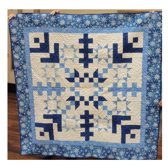
Blue Christmas – another quilt for our auction