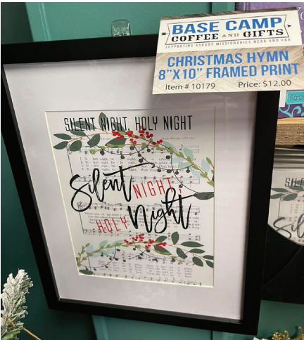
Available Christmas Hymns: Silent Night, Joy to the World, O Holy Night ($12 Framed or $4 Print)