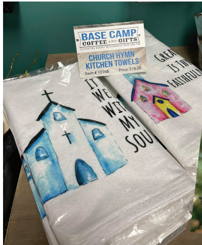
Available Hymn Kitchen Towels: Amazing Grace, It is Well With My Soul, Victory in Jesus and Great is Thy Faithfulness ($18 per Towel)