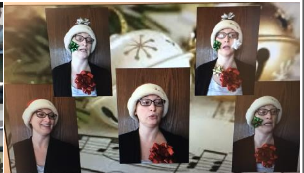
December 20th Blue Christmas Service The recording of this service can be shared by request. Please contact the church office.