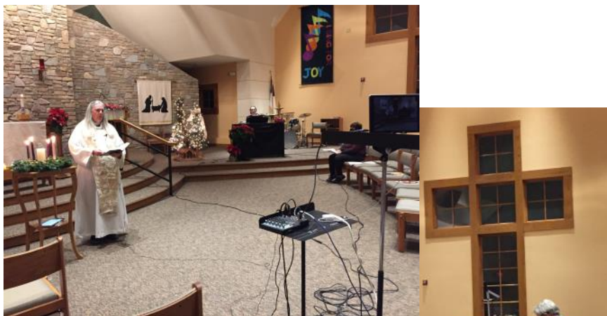
Behind the scenes of our Christmas Eve recording