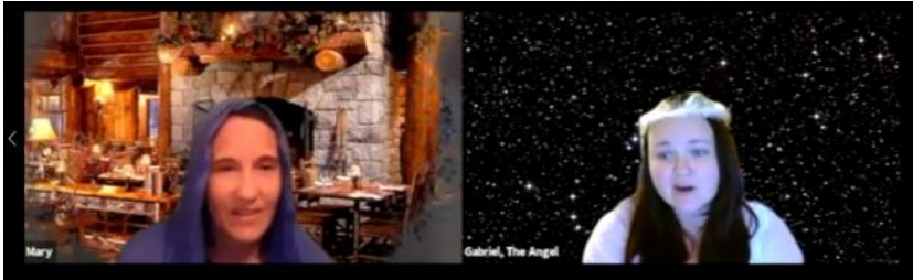
Some scenes from our Zoom Nativity skit