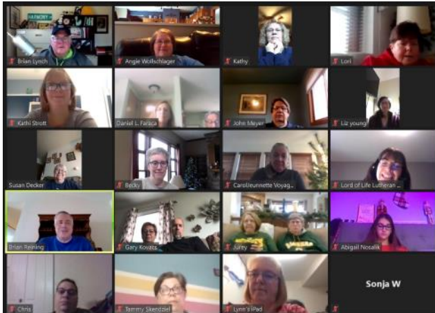
December 6th Mission Possible Coffee Talk