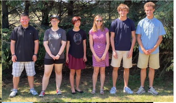
June 13 Lawn Worship & Graduate Recognition