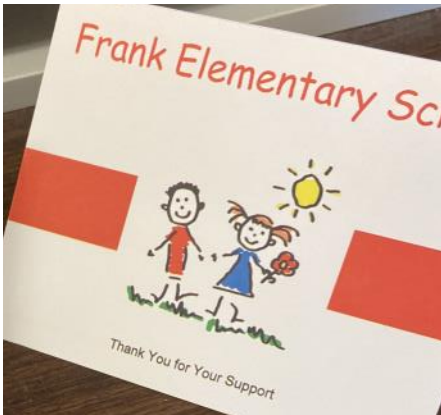
Thank you notes from students at Frank Elementary School for the 124 toothbrushes and 60 tubes of toothpaste we collected in April and donated.