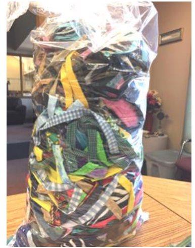
Look at this bag of 112 masks!