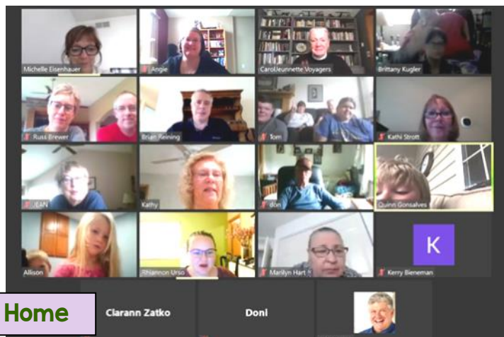
September 26 & 27 Zoom Worship from Home