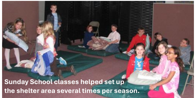
Sunday School classes helped set up the shelter area several times per season.

We say thank you to the volunteers and to the churches — they showed us what "community" is all about.