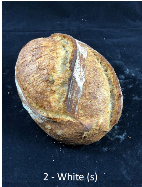
2 - White (s)