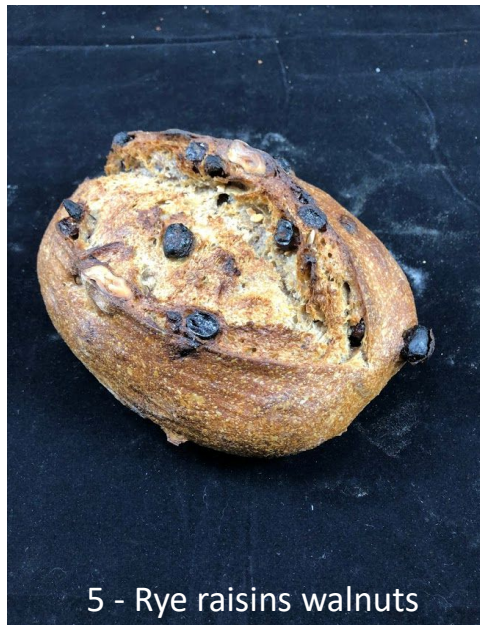
5 - Rye raisins walnuts