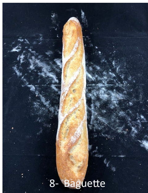
8 - Baguette