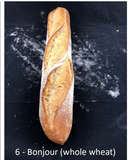
6 - Bonjour (whole wheat)