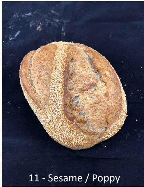
11 - Sesame / Poppy