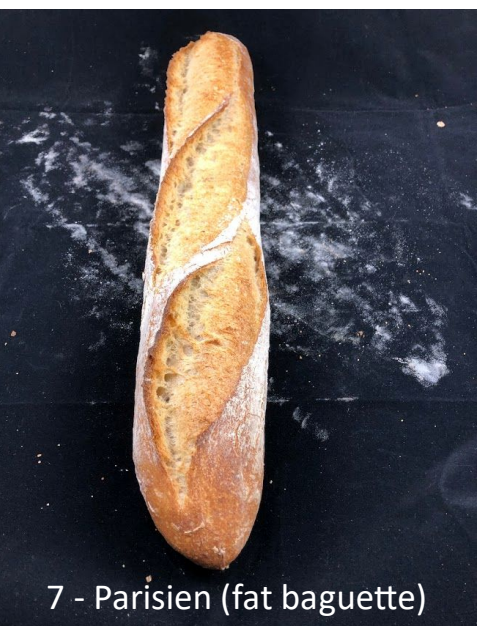
7 - Parisien (fat baguette)