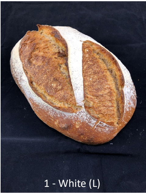
1 - White (L)