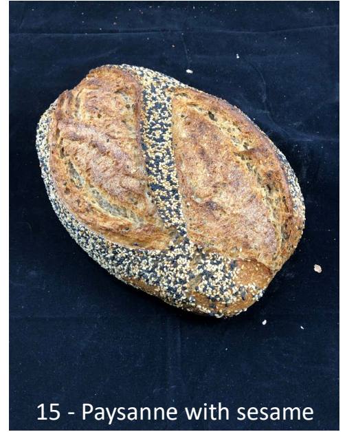
15 - Paysanne with sesame