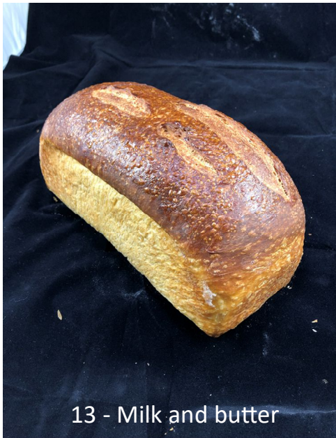
13 - Milk and butter