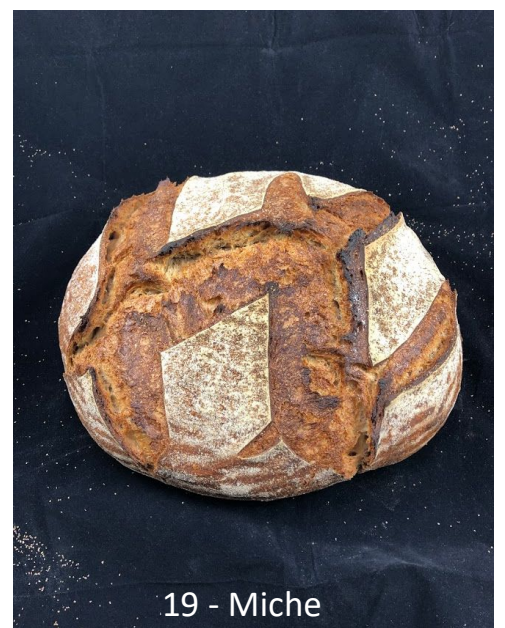
19 - Miche