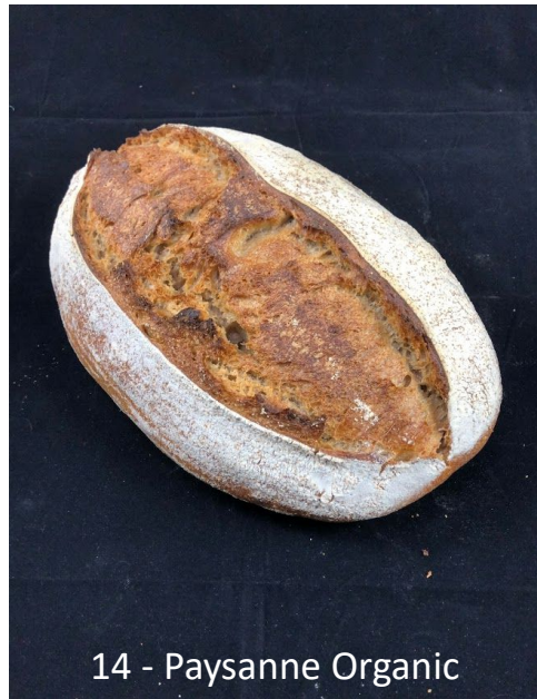
14 - Paysanne Organic