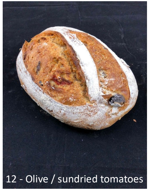
12 - Olive / sundried tomatoes