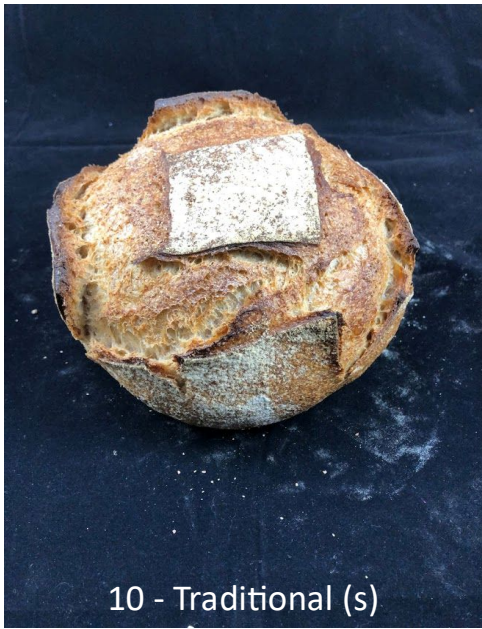
10 - Traditional (s)