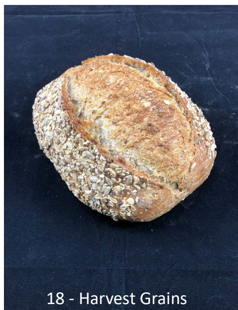
18 - Harvest Grains