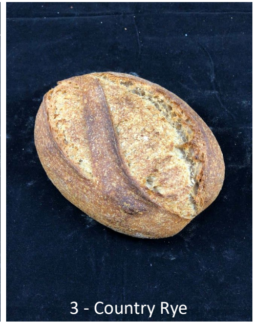
3 - Country Rye