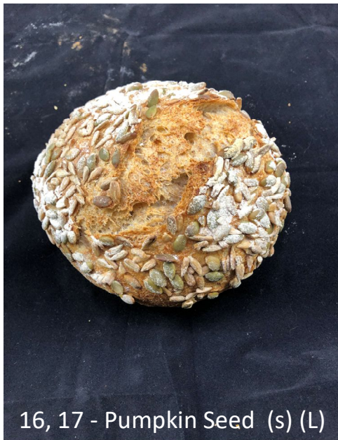
16, 17 - Pumpkin Seed (s) (L)