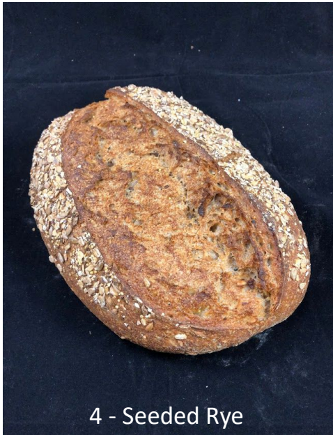
4 - Seeded Rye