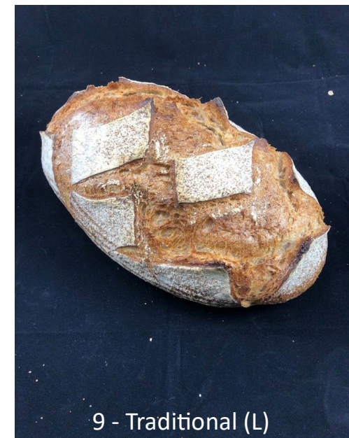
9 - Traditional (L)