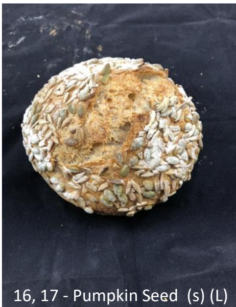
16, 17 - Pumpkin Seed (s) (L)