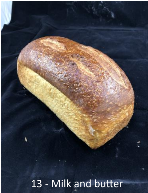
13 - Milk and butter