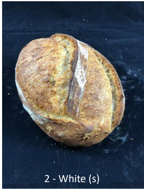
2 - White (s)