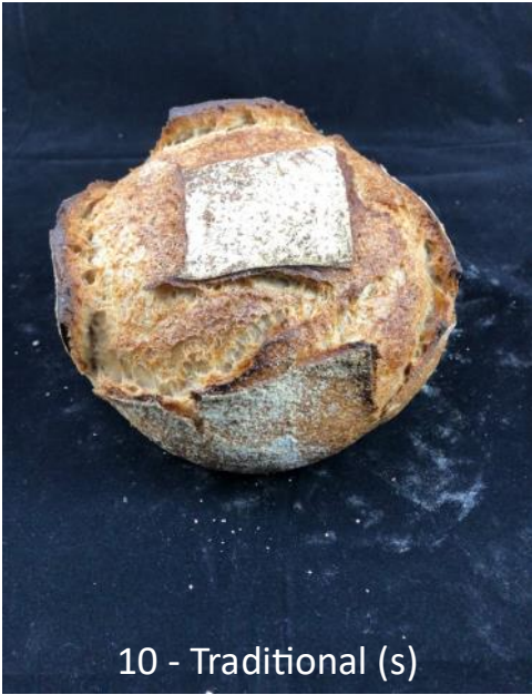
10 - Traditional (s)