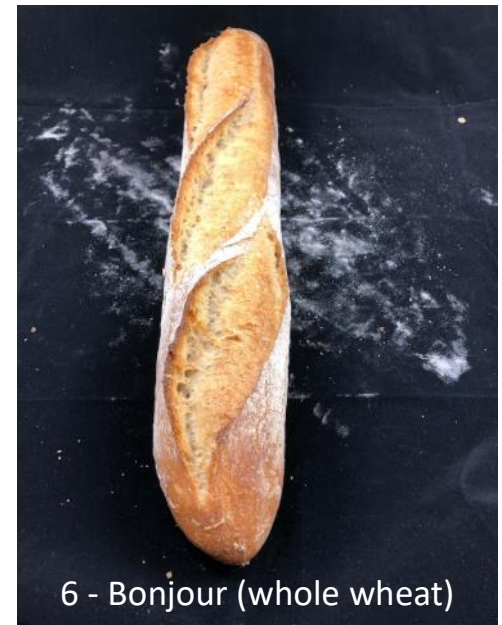
6 - Bonjour (whole wheat)