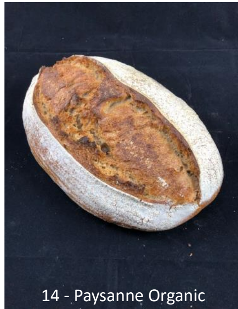
14 - Paysanne Organic