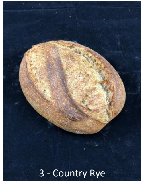
3 - Country Rye