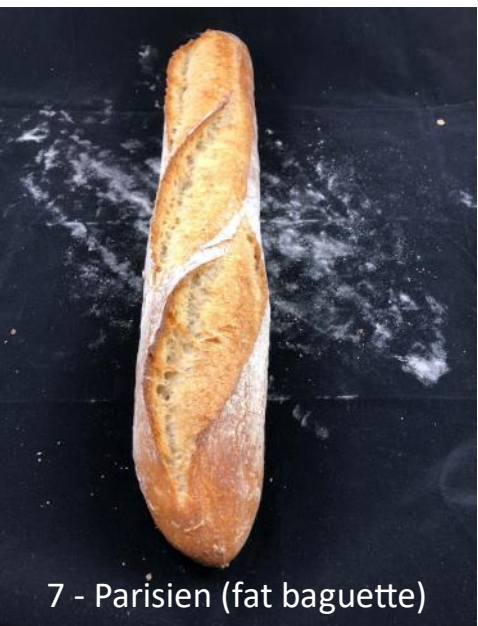
7 - Parisien (fat baguette)