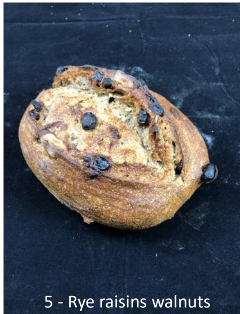
5 - Rye raisins walnuts