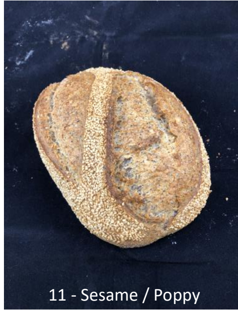
11 - Sesame / Poppy