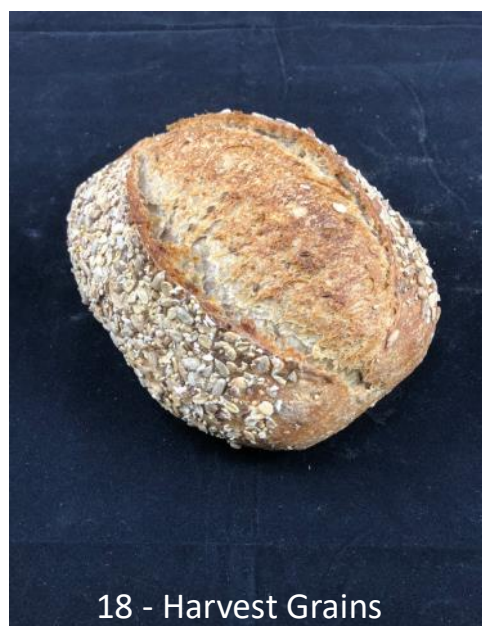
18 - Harvest Grains