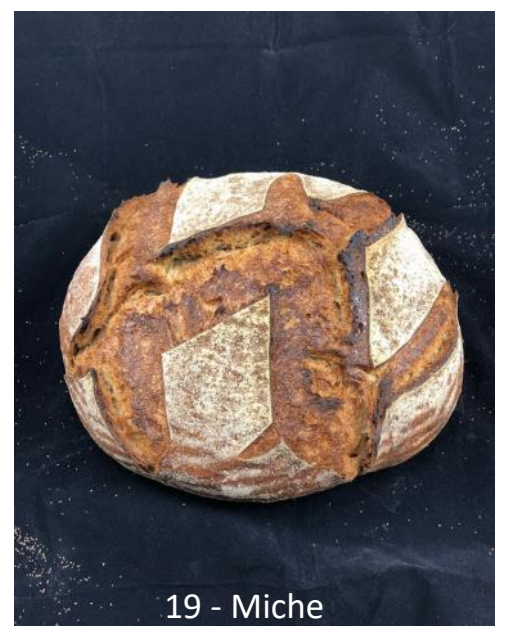
19 - Miche