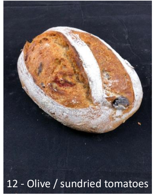
12 - Olive / sundried tomatoes