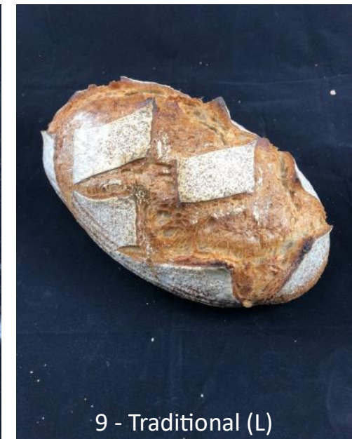
9 - Traditional (L)