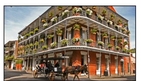
New Orleans, Louisiana

Come & Spend Christmas with us for some Adventure Experiences & FUN or RELAX for 7 Nights with 5 Ports in one Amazing Vacation.