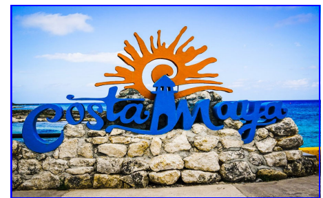
Puerto Costa Maya (Mexico)