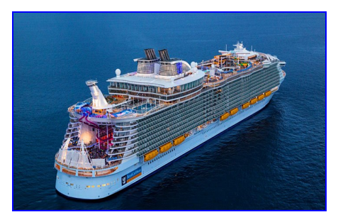
Royal Caribbean "Symphony of the Seas"