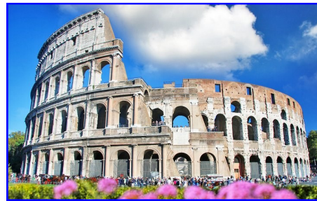
Rome (Civitavecchia), Italy