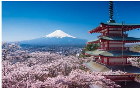
Tokyo (Yokohama), Japan