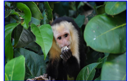
Puerto Limon, Costa Rica

HURRY to Reserve NOW for best availability! ~ Very Limited availability