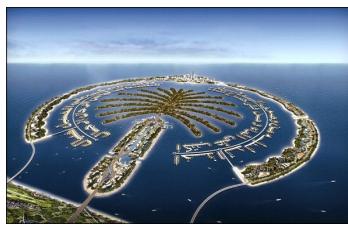
View of the Palm (Level 52 & 360°)