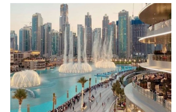
Dancing Water Fountain