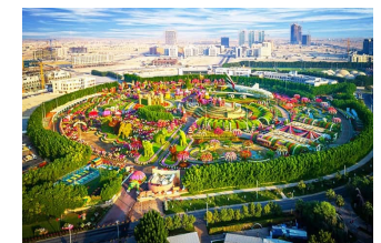
Dubai Miracle Garden