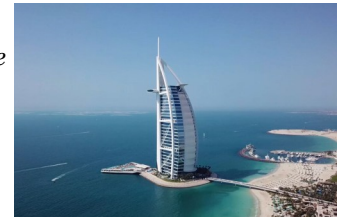
Burj Al Arab