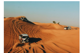
Dubai Desert Safari BBQ dinner