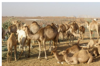
Camel Farm Visit