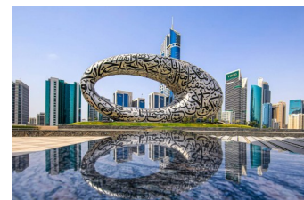
Dubai Museum of the Future

Price in USD per person, based on double occupancy Starting at $2,034* *