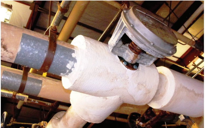
When only one pump operated, there was insufficient flow through the boiler.