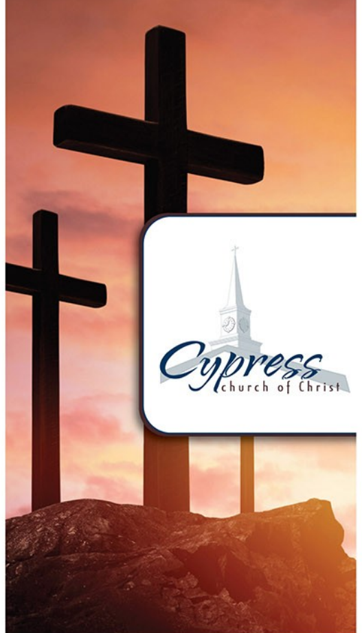
worship times sunday morning 10:00 a.m. sunday evening 5:00 p.m.

bible class (weekly classes see inside) sunday morning 11:50 a.m. CYPRESSCOC.COM (website) our affirmation of faith: "JESUS IS LORD"