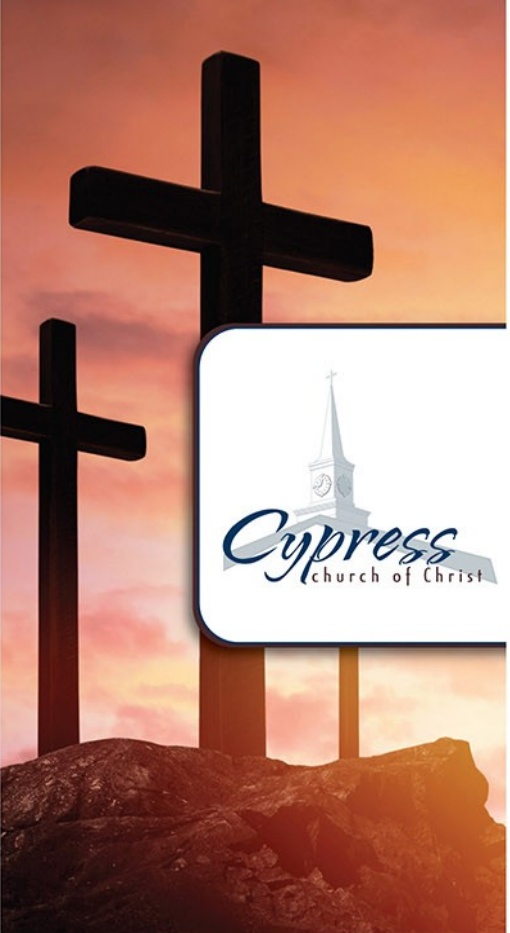
worship times sunday morning 10:00 a.m. sunday evening 5:00 p.m.

bible class (weekly classes see inside) sunday morning 11:50 a.m. Cypresscoc.com (website) our affirmation of faith: "JESUS IS LORD"