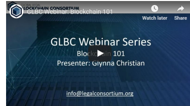
VIDEO: Blockchain 101

FOLA has partnered with two awesome Blockchain communities in the legal space: The Global Legal Blockchain Consortium (GLBC) & The Global Rise Of Women in LegalTech (GROWL) and we have some of their fantastic resources available for you ( FOR FREE!! ).