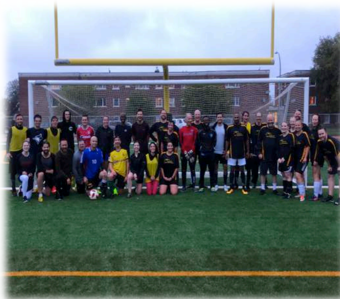
Shortly after this photo was taken, hooligans destroyed the St. Ignatius pitch, mistaking it for Wembley Stadium due to the quality of soccer observed.