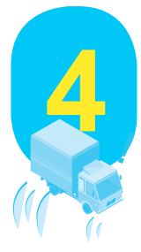
High risk driving & truck idling