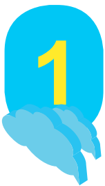
Life damaging CO2 & NOx emissions