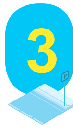
Traffic & parking congestion