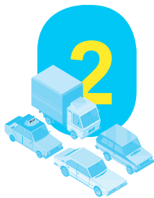
Decline in local small business commerce