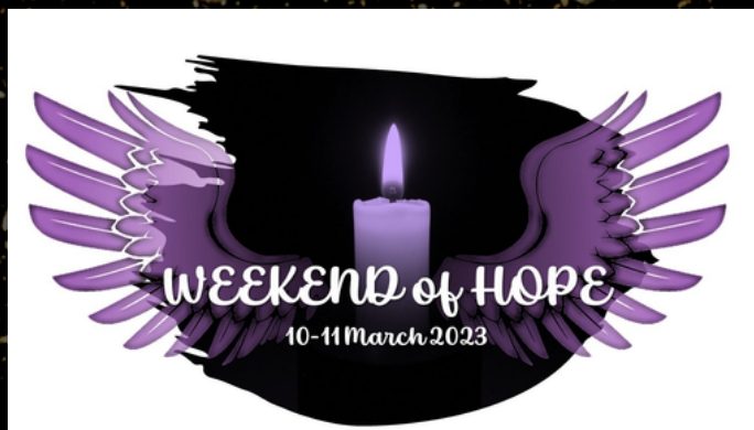
We hosted the Weekend of Hope - an entire weekend dedicated to celebrating the lives of those we've lost to addiction with a special memorial as well as a Summit to provide education, testimonies, and community partnership. March