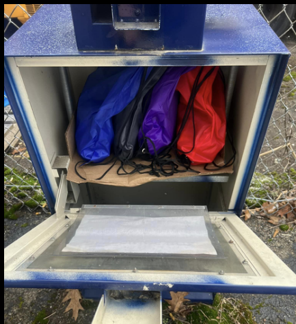
We added a new Blessing Box outside of our main office! January