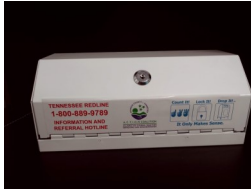
Medicine Lock Boxes