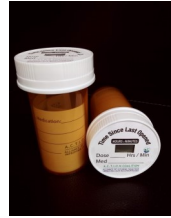
Medicine Bottle Timer Caps