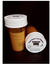
Medicine Bottle Timer Caps

OUR OFFICE IS CURRENTLY OPEN AND WE ARE AVAILABLE TO MEET THE NEEDS OF ANYONE IN OUR COMMUNITY WHO MAY NEED OUR SERVICES!