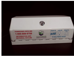
Medicine Lock Boxes