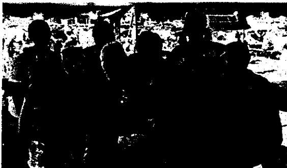
THE AUXILIARY HARD AT WORK!!

THANK YOU TO EVERYONE THAT VOLUNTEERED THEIR TIME AND TALENTS FOR THE 4 TH OF JULY AND VILLAGE DAYS. THEY SAY THAT MANY HANDS MAKE LIGHT WORK, SO HOPE TO SEE MORE OF YOU NEXT YEAR!