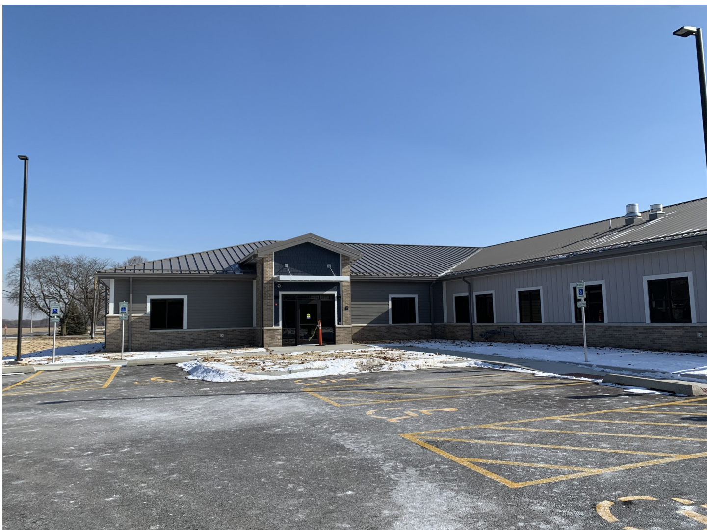
New Livingston County Health Department Building

Everyone you meet is fighting a battle you know nothing about. Be kind. Always.