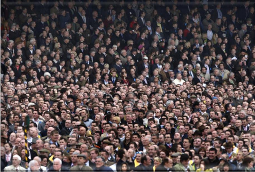
Fig.2. Consciousness defines being

Over the millennia, the progressive minds of the world's thinkers have constantly been directed by their research, their results, and their judgments, to resolve the main philosophical question - what are people intended for on Earth, what is the purpose of their life, what are the goals of the development of civilization... Up until the present day, this has been far from an idle area of research, since the MOST STRATEGIC PARAMETERS for the common and local future and much more, depend on them. Therefore, they are of concern to leading thinkers both in Russia (which, unfortunately, are very few) and throughout the world. But the practical results so far create more questions than provide comforting answers, and only add MORE UNCERTAINTY IN THE FUTURE existence of not only a person himself, but also life on Earth as a whole, which more and more people have been convinced of lately. The beginning of the twenty-first century was not an exception to this, but on the contrary exacerbated the problematic nature of all aspects related to existence. All structural forms and methods of the organized modern life of people are affected by the constantly growing scale of crises and social cataclysms. People have lost the ability to be rational.