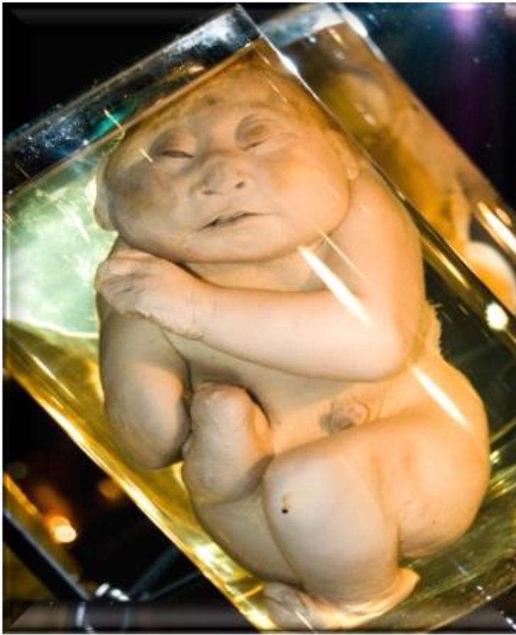
Fig. 4. Unusual people of the world

In the absence of control over the general processes of being, as well as if there is a failure to maintain the energetic harmony of the entire environment, the most problematic issue of the existence of the former "intelligent life on Earth" cannot be sustained as such, since unorganized existence is able to liquidate itself over 3-4 generations of people! All the destructive vices they previously acquired will work, like "squibs" for self-destruction. First of all, general brain degradation will play a significant role in this destruction. And this must not be allowed to happen, although today, in reality, this degradation of the so called "ruling élite" is already visible with the "naked eye." And to the question - "what is happening to our rulers, have they all gone crazy?" there is only one answer: without informational support from the former Control Complexes, most of the previously established functions in individuals of brain genotypes 42, 44, and 46 cannot have an actively operational disposition. Their awareness of the surrounding "objective"