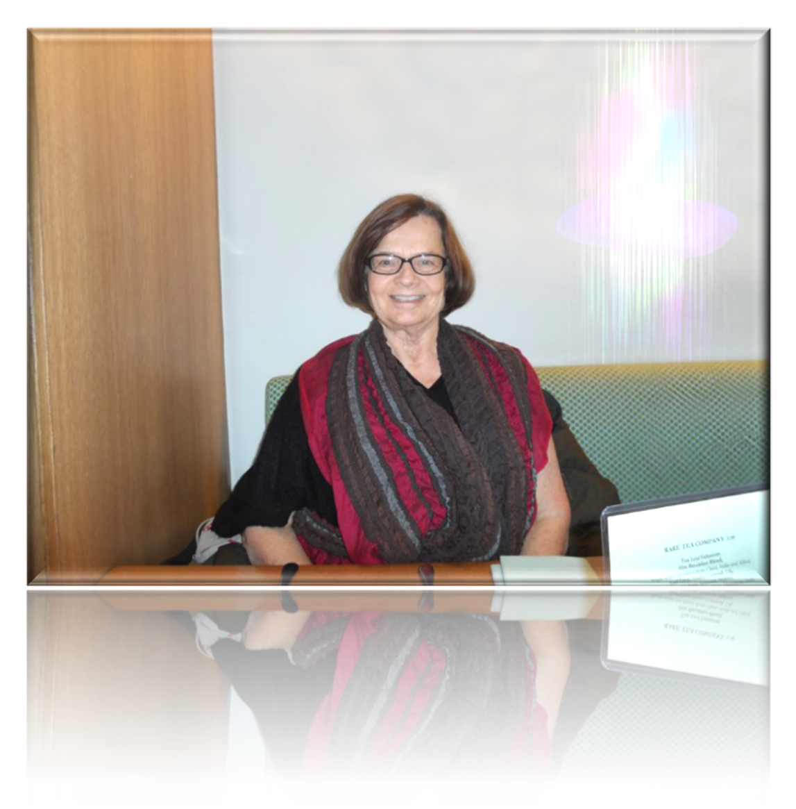
Development and the Subtle Bodies

Our life and growth from infancy, through childhood and adolescence, and finally into adulthood takes us through the phases with which we are all familiar... growth and control of our physical bodies, experience and mastery of our emotions, and adult maturity that permits the actualization of our life's plan and dreams. A fact of which most of us are unaware is that these phases correspond to the development of our subtle selves or bodies, material bodies that are as much clairvoyant sight. It is the proper construction of these unseen bodies that brings us to wholeness and to the ability for fullest expression of our spirit or soul.