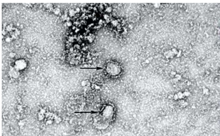
(первый снимок коронавируса 2019-nCoV)

Nobody is going to beg or persuade people to change. At a certain stage in the ongoing changes in the Life Support System, which are unavoidable and NOT UNDER HUMAN CONTROL , the chemical elements listed (albeit incompletely) in the periodic table of Mendeleev, will acquire (and are already acquiring) quite different properties (sulfur, for example, will cease to be flammable), which will force people to change their extractive and consumerist relationship with Nature.