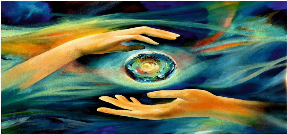
F. Shkrudnev February, 2020