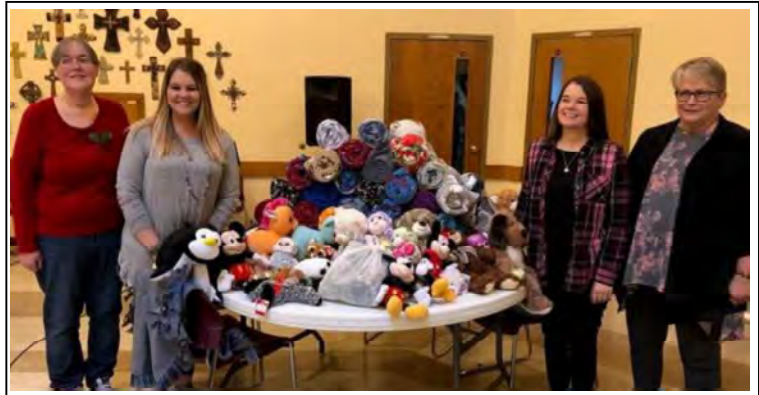
Disciples Women's Fellowship at Pittsburg First Christian Church Collected toys and blankets for the Child Advocacy Center here in Pittsburg. Representatives from the center spoke at the December meeting about the services of the advocacy center and the DWF presented them with the collection.