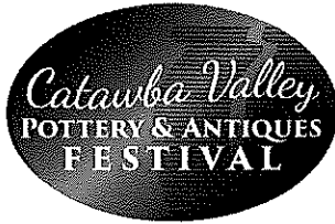
EXHIBIT SPACE APPLICATION/CONTRACT 25th ANNUAL CATAWBA VALLEY POTTERY FESTIVAL